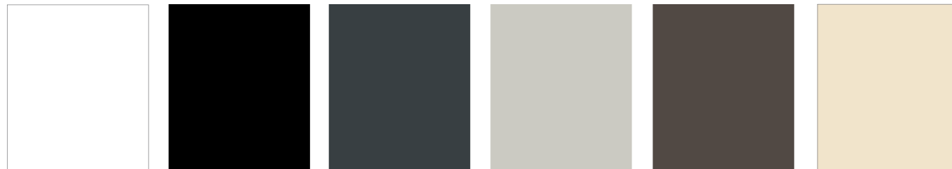
White (9910 high gloss) Black (9011 semi gloss) Grey (7016 matt) Silver Grey (7035 semi gloss) Brown (BS08-B29 semi gloss) Cream (BS08-B29 semi gloss)

Bi-fold doors can be coloured on one or both sides, and feature a matt or gloss finish depending on your chosen colour (other RAL colours available upon request):